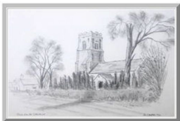
Ss Michael & All Angels