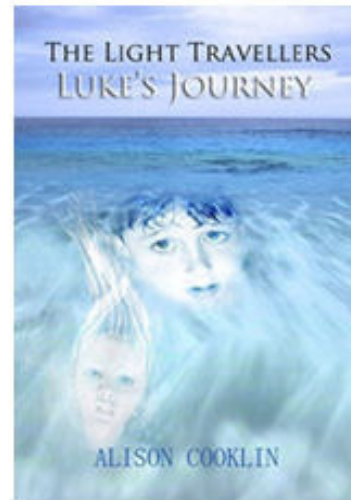
Local author publishes her first children's book