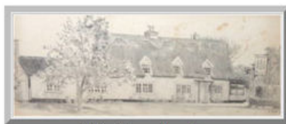
The Bottles Inn