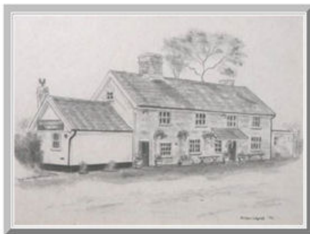
The Beaconsfeld Arms