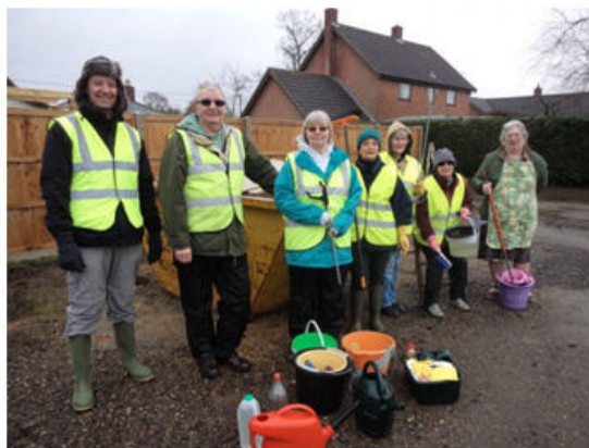
Clean for the Queen