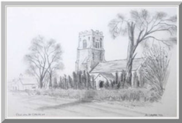
Ss Michael & All Angels