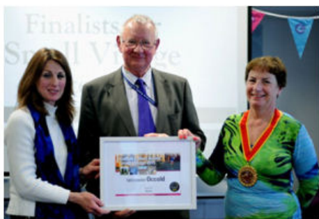
Most Active Community Award