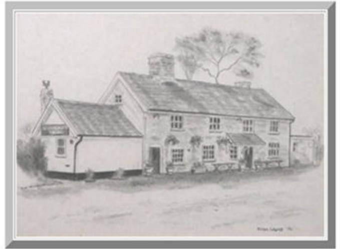
The Beaconsfeld Arms