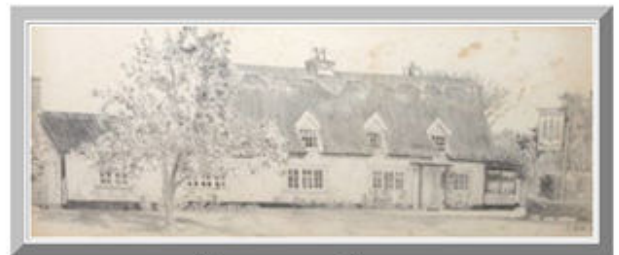
The Bottles Inn