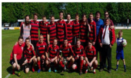
Occold Football Club