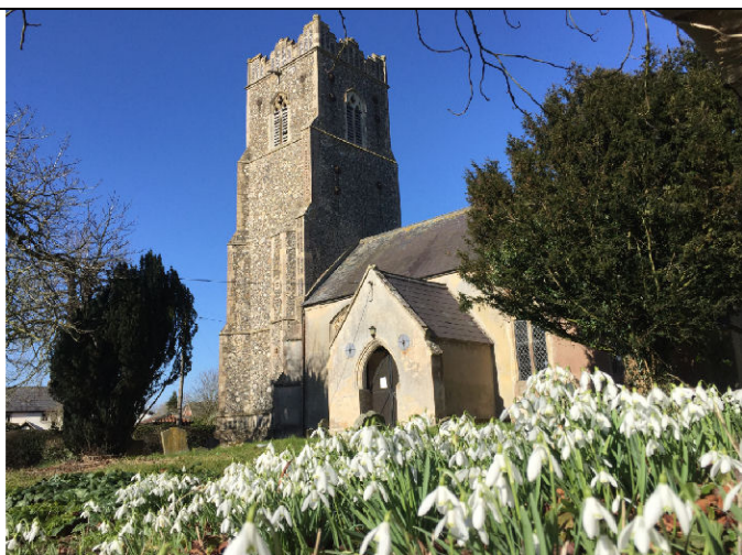
First snowdrops of Spring