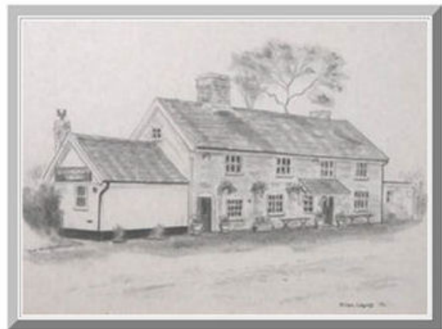
The Beaconsfeld Arms