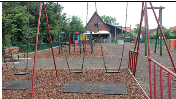
Play Area make-over