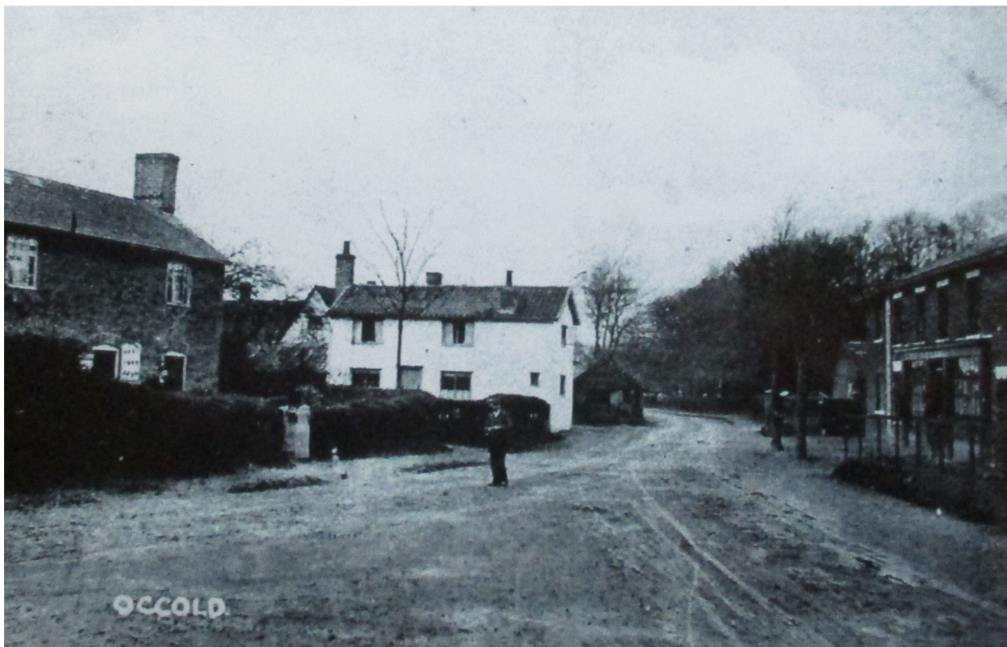
Recently acquired view of The Street