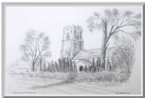
Ss Michael & All Angels