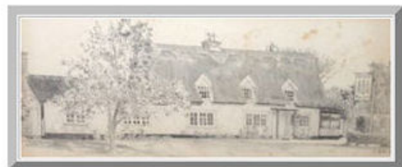
The Bottles Inn