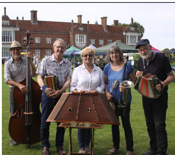
“Bristol Fashion” at The Beaky